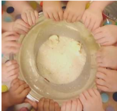
Our Pre Prep 2 children made pancakes for shrove Tuesday.