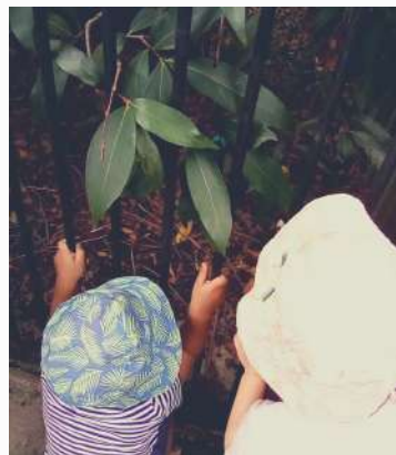
Our Toddlers and Juniors rooms went on a bush walk around the centre and looked at all of the trees and plants