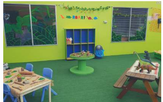
Our dome area had lots of use with all the rainy days we had! The children have been enjoying the new imaginative play area and all of the dinosaurs too.