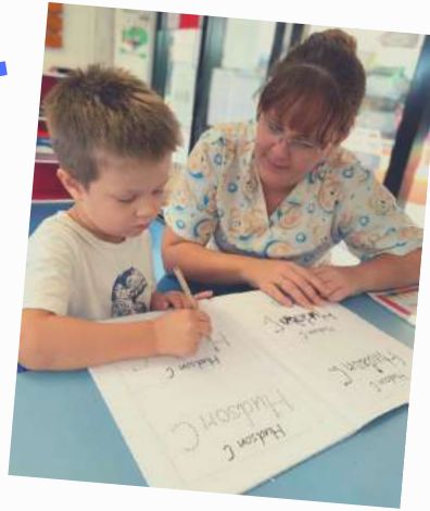
The children in Pre Prep 1 have started "Signing In" each day.