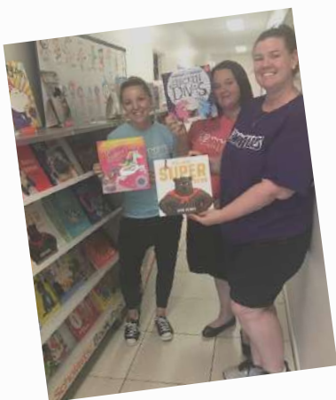
We had the book fair arrive and raised over $170 to buy books for our centre