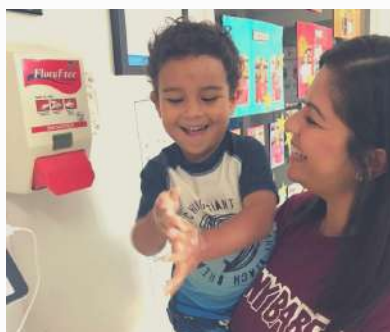
The children have been learning about how important hand washing is. We have sanitiser on the wall in reception.