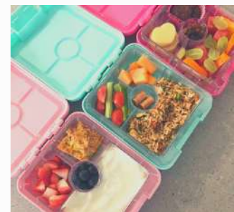
The children started bringing their own lunchboxes to kindy and we learnt about healthy food choices. Here is one of the healthy lunchboxes we saw come to kindy.